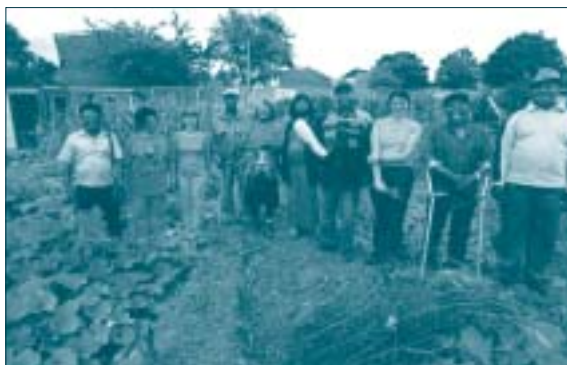
Growing Opportunities, Smethwick, W.

For more information see ARI factsheet Project Allotment and the Good Sites Guide .