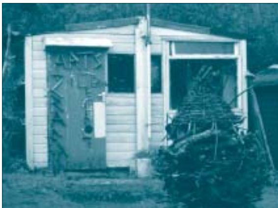
One way to widen the benefits of allotments is to provide community buildings – in this case a 'crafts shed'

Gardening groups may also require secure tool storage, improved water facilities, polytunnels, disability access plots, a gardening library and improved security.