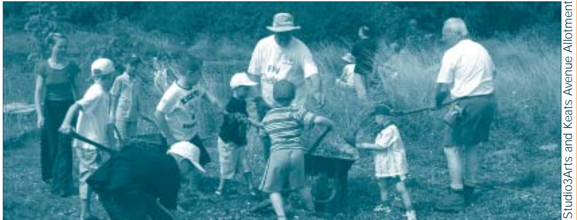
Studio3Arts and Keats Avenue Allotment