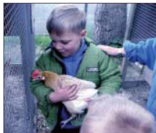
Oatthall Community College Farm, W. Sussex

our support scheme for members' events, ran throughout summer 2004. The scheme helps our members welcome visitors and raise funds for their sites by offering publicity materials and resources. We were very sad to hear of the death of John Peel, who was to judge this year's photograph competition with Bob Flowerdew. The winning photograph is shown below.