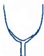
Bush on M26 - dwarf, upto 3m