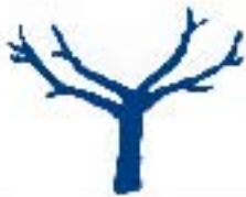
Bush or standard