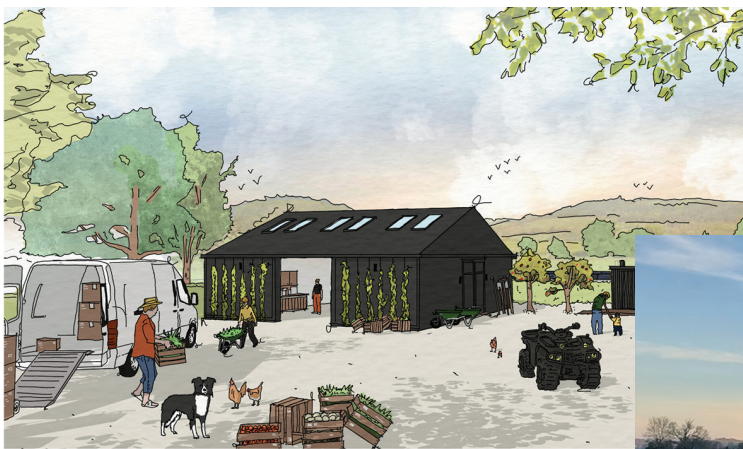
Artists impression of packing & storage shed

Groundworks have commenced onsite in January 2025