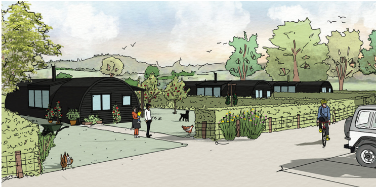
Artists impression of Nissen Hut dwellings