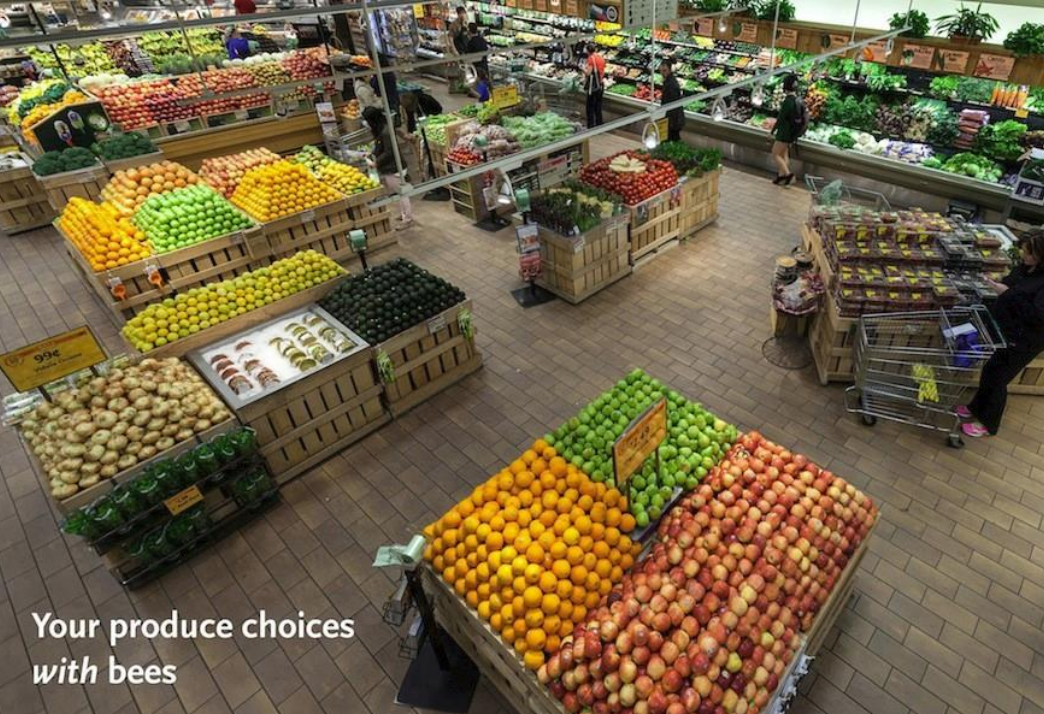
Your produce choices with bees