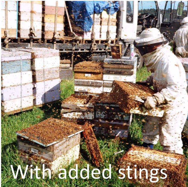
With added stings