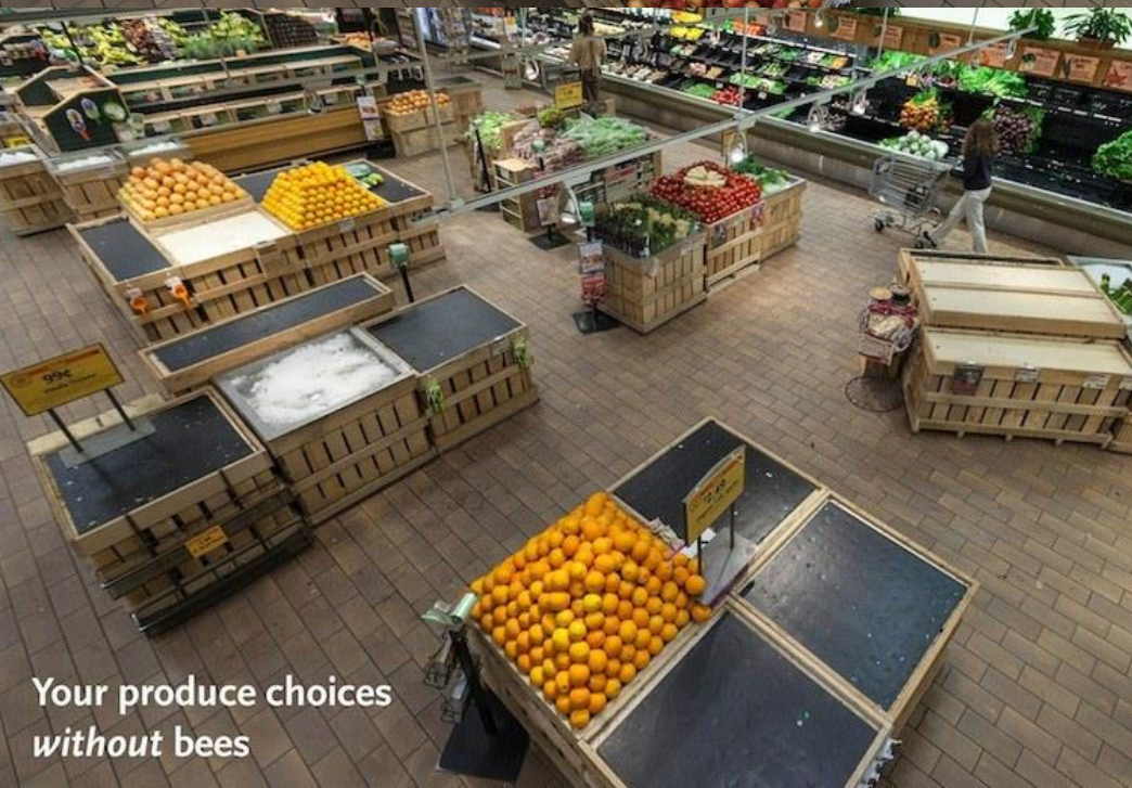
Your produce choices without bees