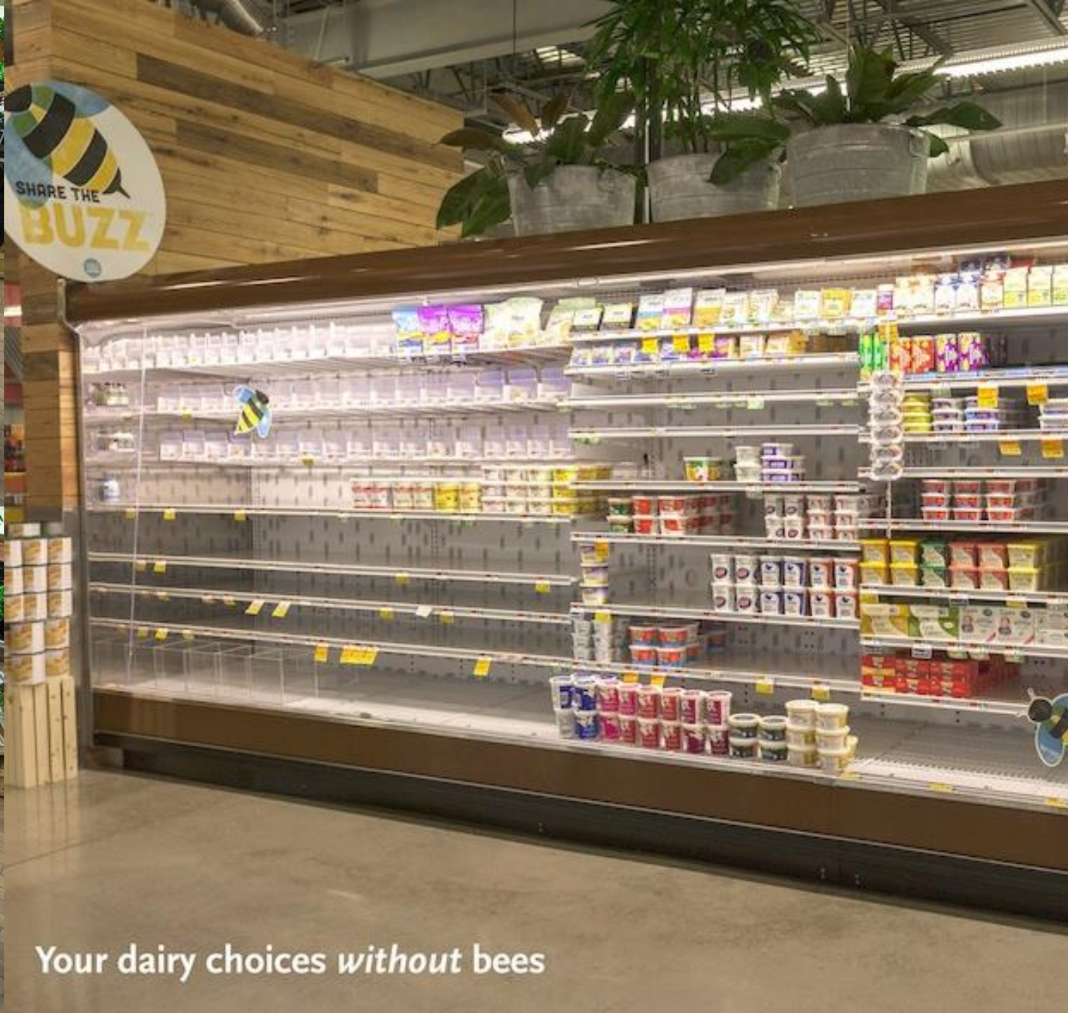
Your dairy choices without bees