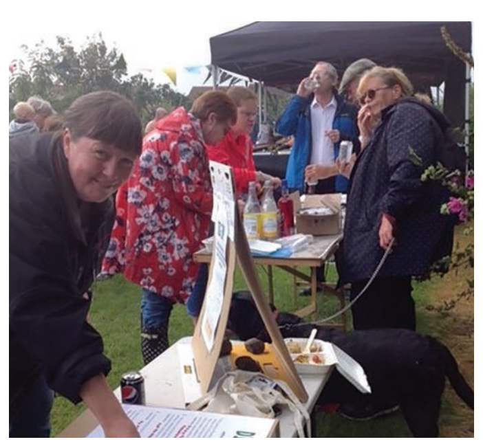
Eden Allotments - Participatory Budgeting Vote Mid & East Antrim Council