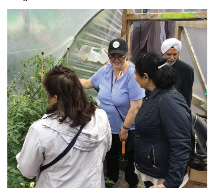
Donegall Pass Community Garden - 'The Garden of Eatin' Donegall Pass Community Forum

There are many different models of community garden - see diagram page 13 for some common types. The design of each garden is dependent on use, with some focused on the community side, others on health, others more production focused, and others designed for wildlife. Other factors affecting design are budget, features of the site aspect, slope etc, what the surroundings of the garden are and who will be using it.